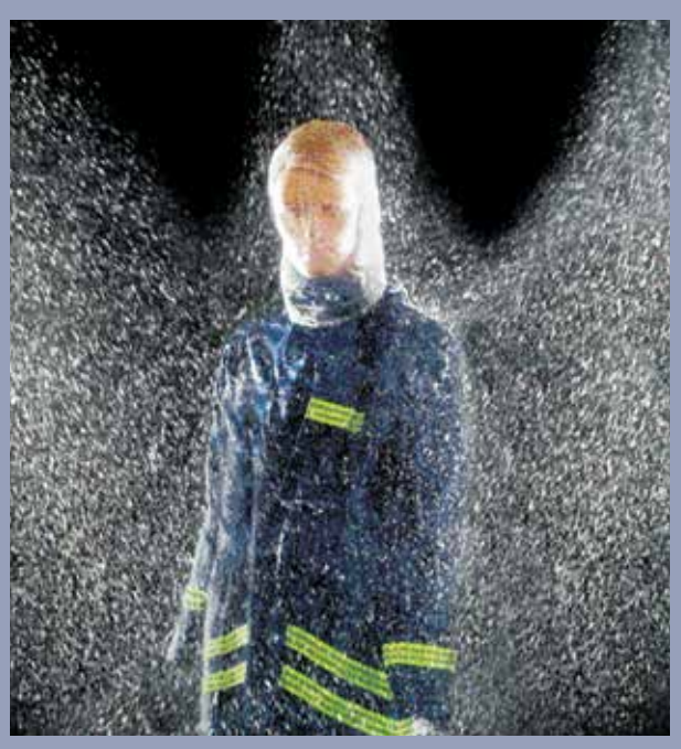
The NFPA 1999 Liquid Integrity Test evaluates a garment's design, construction quality, and seam sealing for waterproof integrity.

*Data derived from typical Gore laminate performance. Note: An Rct value of all materials has been assumed to be .067°Cm²/W in the THL calculation. A lining Ret of 20 ( m^2 mbar/W \times 103) has been added to all "2-layer" garments.